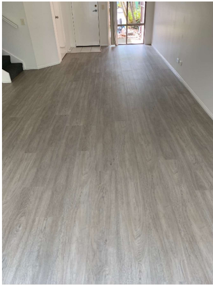
Vinyl plank $2100