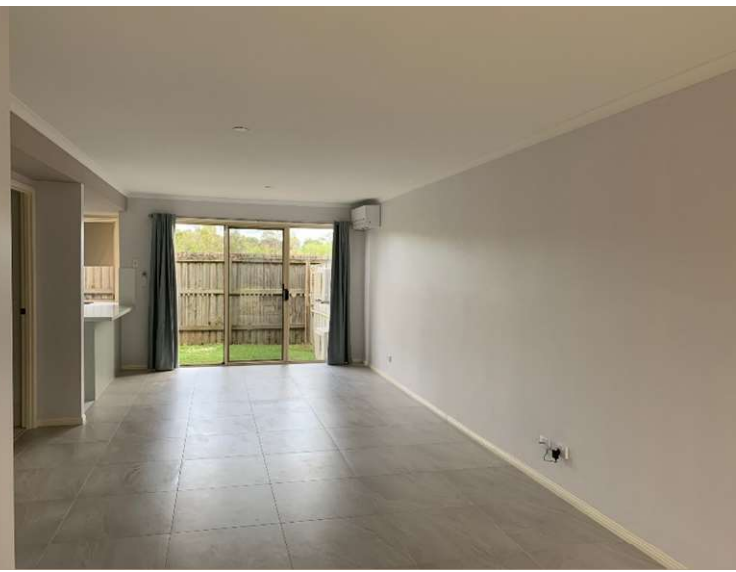
600 X 600 tiles through lounge not including kitchen

If it was carpet floor originally, $2000 labour install only