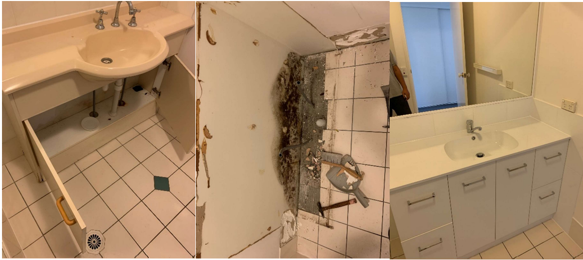
Tile around behind the new vanity, 4 days work, supply and install tiles and vanity for $1500